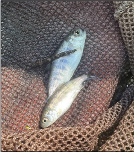
Figure 2.—Juvenile coho salmon caught in braid at waypoint 1078.