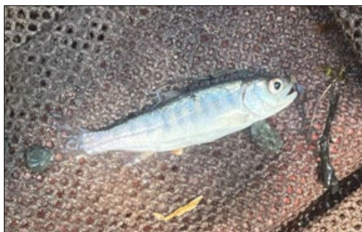
Figure 1.–Juvenile coho salmon caught at waypoint 1075.