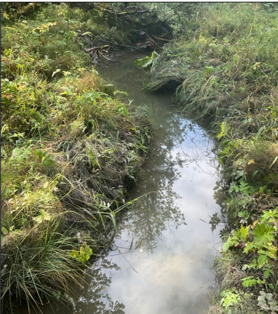
Figure 4.—Looking downstream on main channel at waypoint 1068.