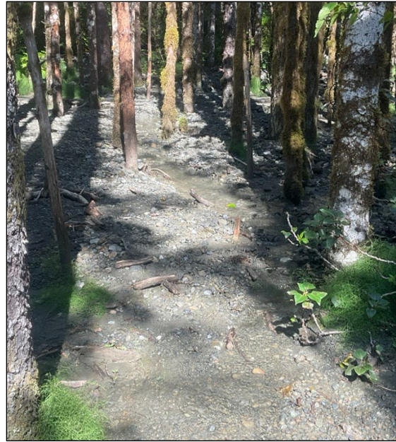
Figure 3.—Looking upstream in the braid at waypoint 1079.