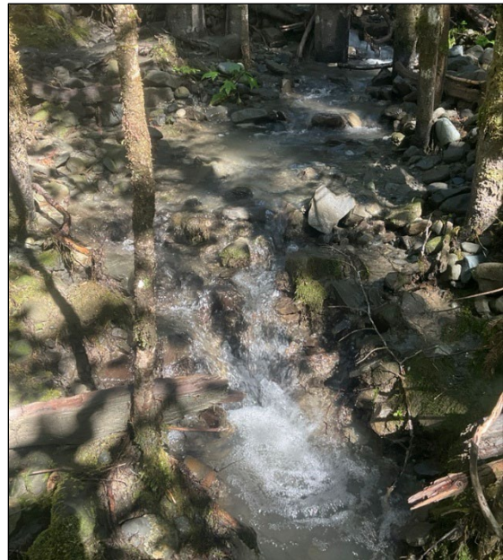
Figure 5.—Looking upstream on main channel at waypoint 1074.